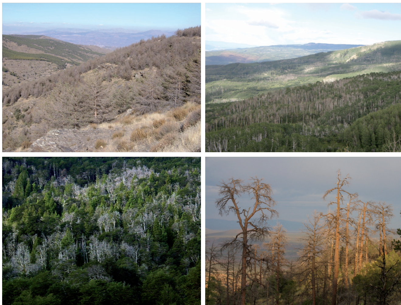
Figure 1 | Images of climate-induced forest die-off from around the world. Clockwise from top left: Spain, Colorado, New Mexico and Argentina. Top right and the two lower images are reproduced with permission from ref. 4 © 2010 Elsevier.